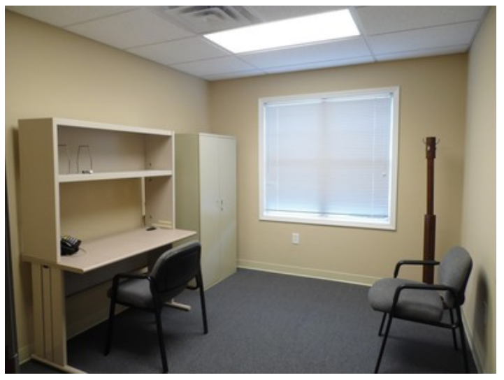
10412 Allisonville Rd. #112 separate office