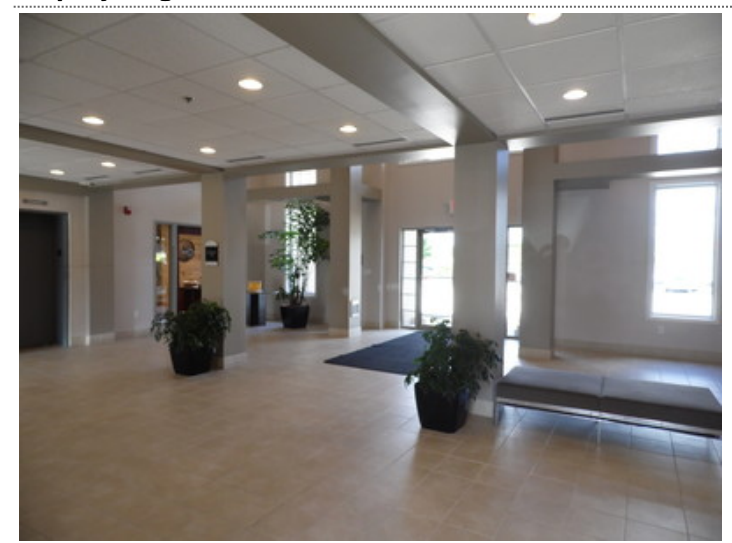
10412 Allisonville Rd 112 Lobby